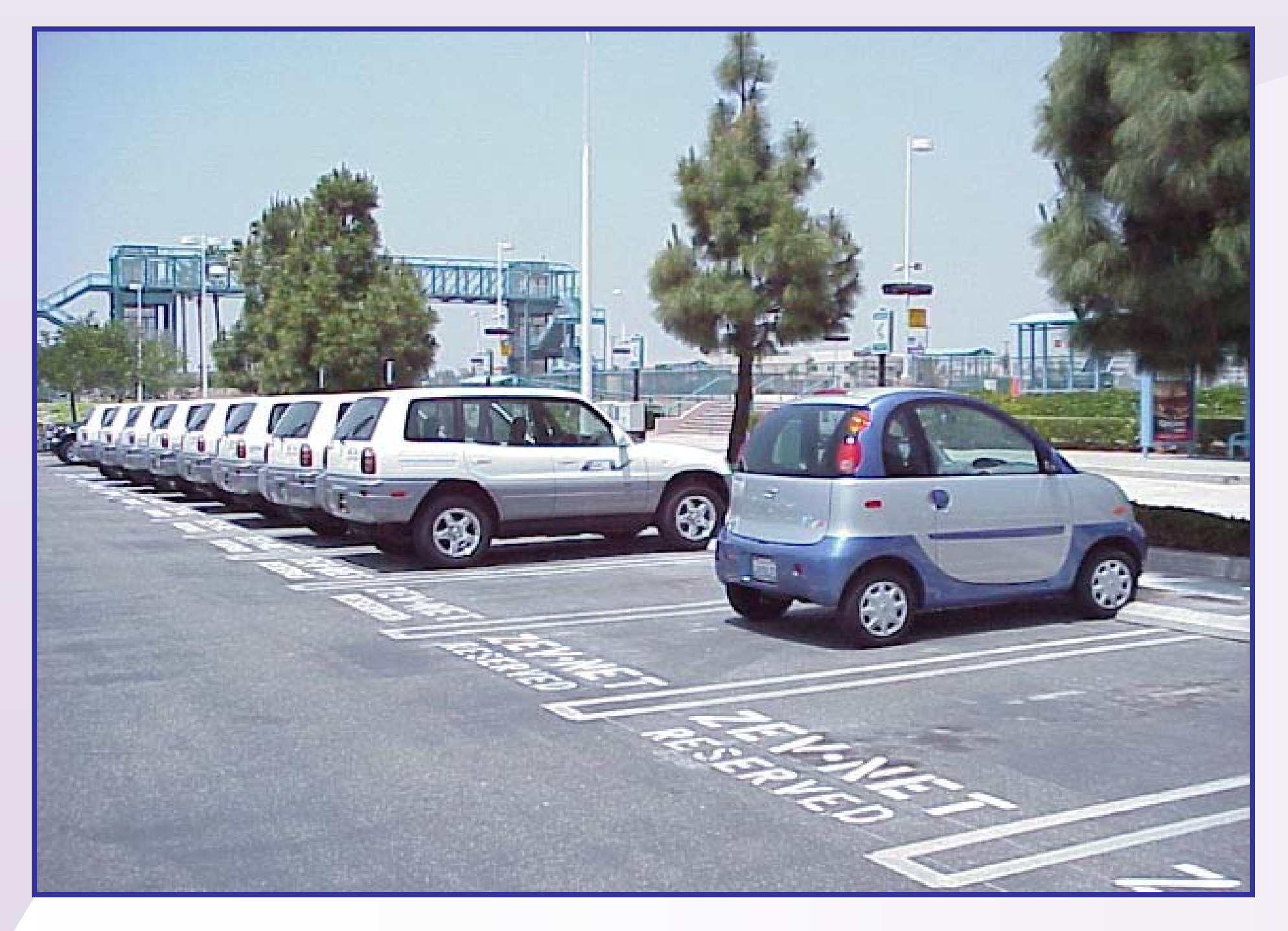
ZEVNET vehicles parked at the Irvine Transportation Center

ZEV•NET has demonstrated market viability for 8 continuous years. There is currently a waiting list of southern California businesses interested in joining ZEV•NET as a positive environmental choice and a benefit for employees. Numerous local companies, ranging from small businesses to large Fortune 500 companies have contacted UC Irvine in an effort to participate in ZEV•NET.