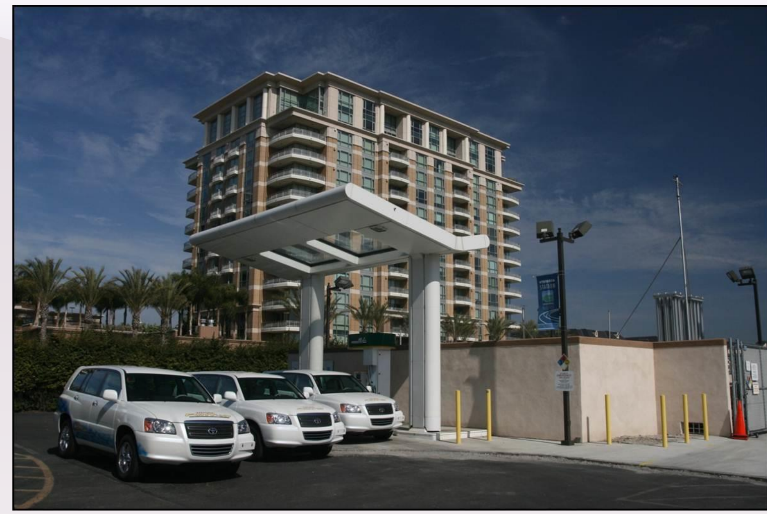
Toyota FCHV-Adv fuel cell vehicles at the UC Irvine Hydrogen Station