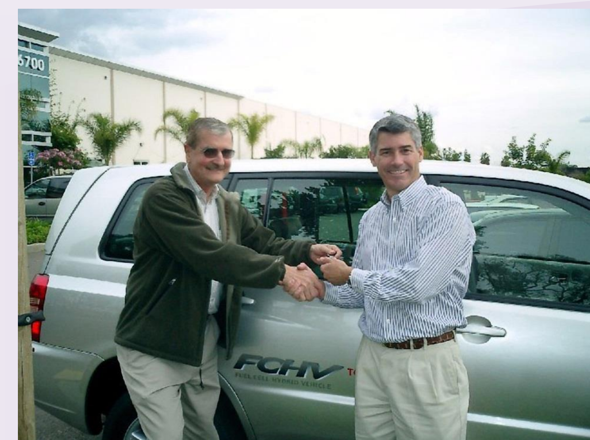
Delivery of first FCHV to Orthodyne Electronics (12/2002)